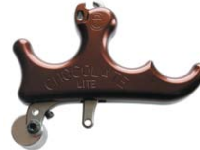
Ember 1 as a thumb trigger